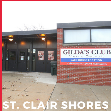
ST. CLAIR SHORES